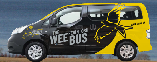
Electric Vehicle wheelchair accessible

Service available in the Ferintosh Community Council area, Monday to Friday, between the hours of: 09.30 to 16.00 (Community use outwith these hours - See Leaflet)