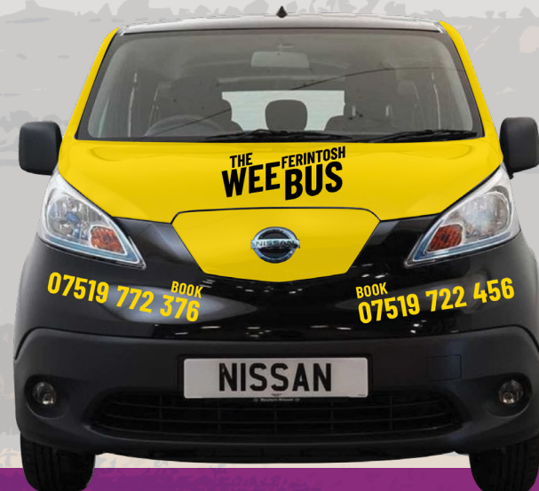
Service No.22 Inverness - Culbokie Monday to Friday

Who is putting this pilot together? A partnership of HITRANS, Stagecoach, The Highland Council, CSI Ross-Shire and Ferintosh Community Council (supported by Culbokie Community Trust) has assembled this pilot.